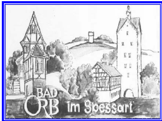
Bad Orb, Germany

The aim of the workshop is to provide a forum of information concerning all questions related to fine-scale modelling.