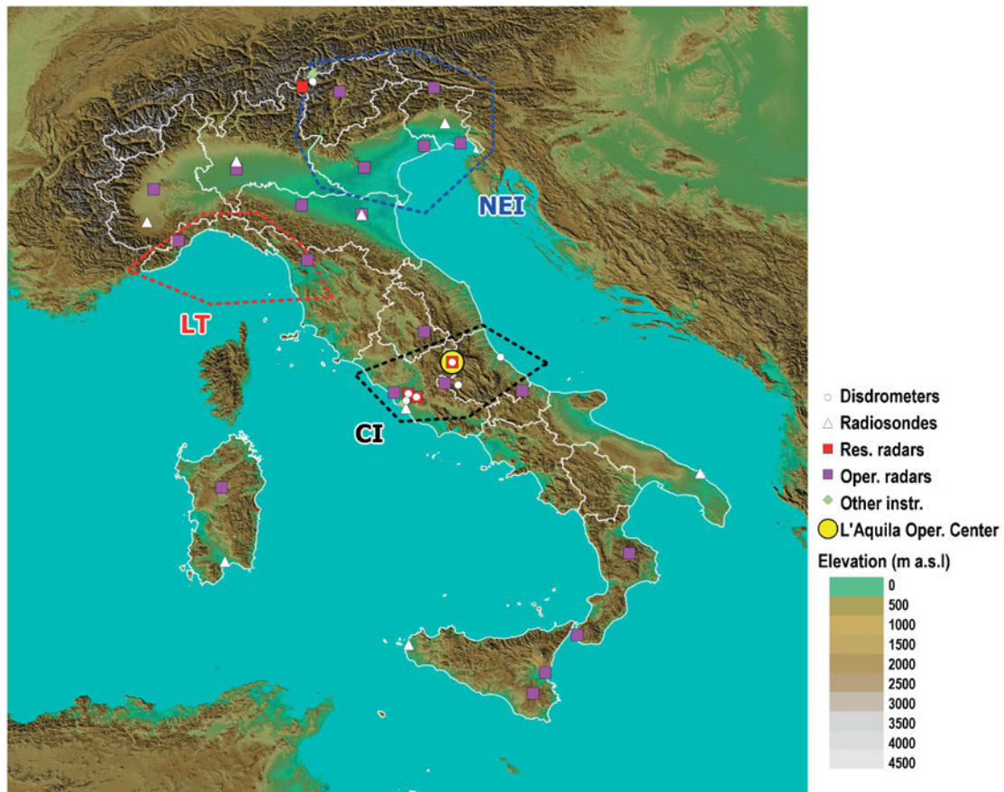
Figure 1: Map of Italy with the three areas (LT: Liguria-Tuscany; NEI: North-Eastern Italy; CI: Central Italy) identified as hydro-meteorological target sites during the SOP1. The locations of weather radars, radiosonde launching sites, disdrometers, and other instruments as well as the Operational Centre in L'Aquila are also displayed.

Among the target areas in the western Mediterranean basin monitored during the field campaign were three hydro-meteorological sites in northern and central Italy (Fig. 1). An Alpine site was selected in the region (north-eastern Italy) characterized by the maximum amount of mean annual precipitation (ISOTTA et al., 2013). The two other sites were selected in regions recently affected by heavy rainfall events, such as those occurring in fall 2011 that produced devastating effects in Liguria and Tuscany (see e.g. REBORA et al., 2013), as well as in central Italy (FERRETTI et al., 2012). Indeed, similarly to the Alps, the Apennines, with steep slopes only 50–100 km from the coastline, can influence atmospheric motion at different scales. The Apennines are often responsible for triggering convective instability processes, which suddenly release energy and moisture gained through intense air-sea exchanges (TURATO et al., 2004; MIGLIETTA and ROTUNNO, 2012; BUZZI et al., 2014). Within small and densely urbanized watersheds present in most of the Italian territory, precipitation events persisting over the same area can result in dangerous floods in a relatively short time, sometimes leading to disastrous consequences (BORGA et al., 2007; SILVESTRO et al., 2012; MARCHI et al., 2013).